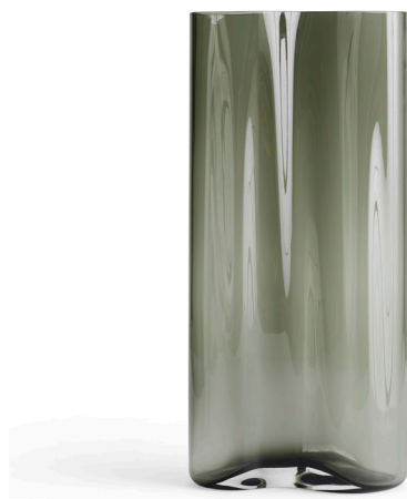
Aer Vase, 49, Smoke 4737949