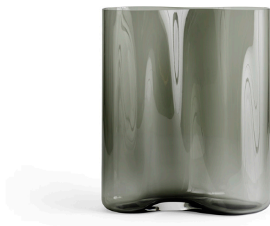
Aer Vase, 33, Smoke 4736949