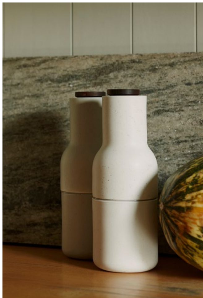
Bottle Grinders, Ceramic, by Norm Architects

Atypical for traditional salt and pepper mills, MENU's Bottle Grinders are shaped like bottles to cleverly trick the user into engaging with the design in a playful and experimental way. Fitted with a powerful ceramic mill that makes light work of grinding a wide range of spices, Bottle Grinders are easy to operate, fill and clean, and the upright design ensures surfaces remain free from unwanted residue. Available in a range of colours and finishes, the collection's most recent additions are carefully crafted from ceramic, featuring an ivory or grey matte glaze finish that displays small, deliberate imperfections for a handmade look and feel. The versatile kitchen accessories come fitted with a harmonising walnut wood lid.