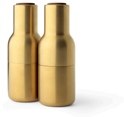
Brushed Brass 4415839