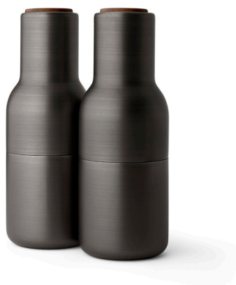
Bronzed Brass 4415859